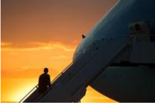
Obama Behind the Scenes