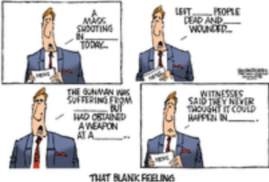
Gun Control Cartoons